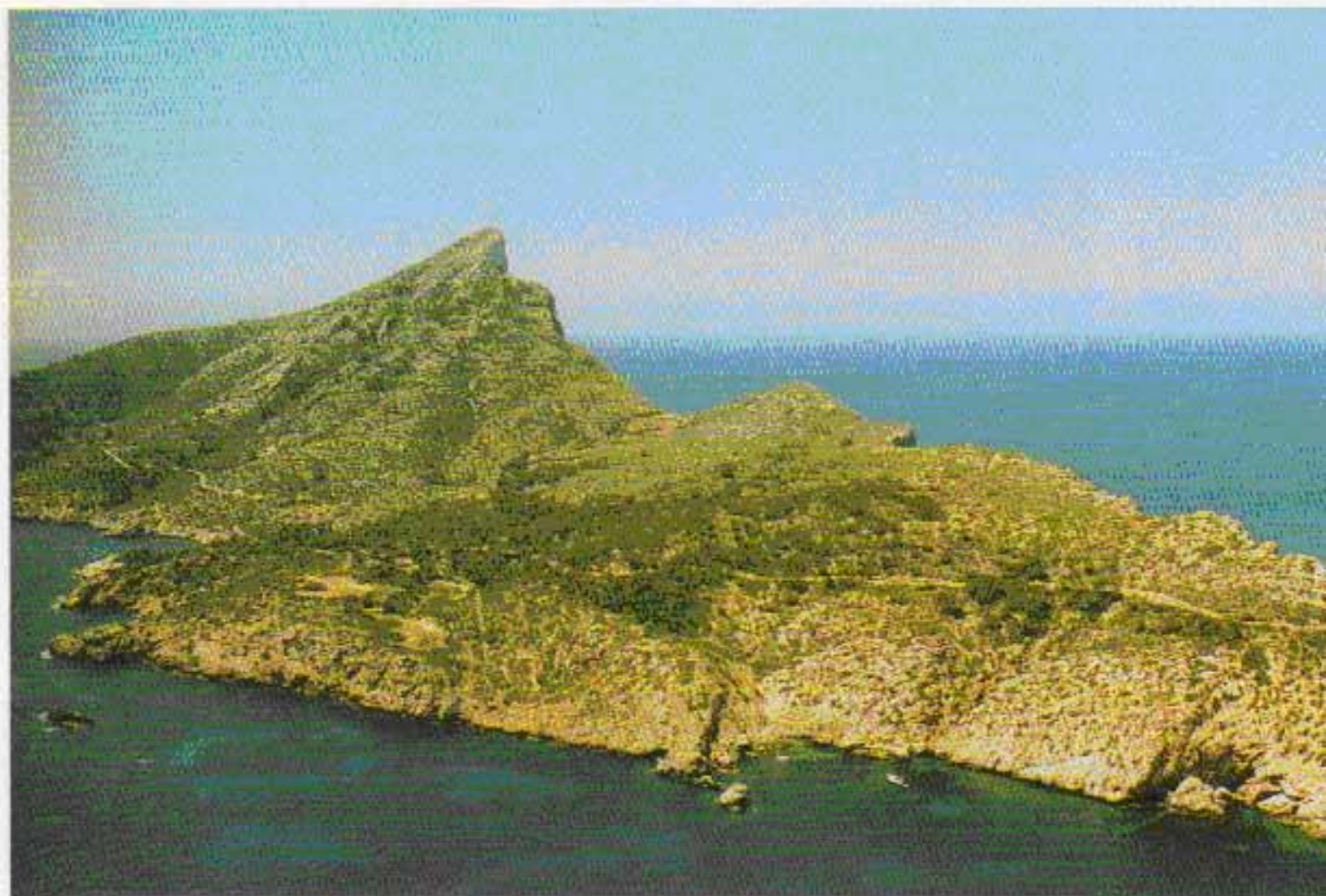
The central part of Isla Dragonera looking just south of west, with Cala Enrengan in the centre and the spectacular Puig de Sa Popi on the left. Part of Cala Lladó can be seen at far left.

⚓ Cova dels Bosch A wide open, cliffed cala , open from east round to south and to swell from southwest. Careful eyeball pilotage is called for. There is a low, isolated rock to the east.