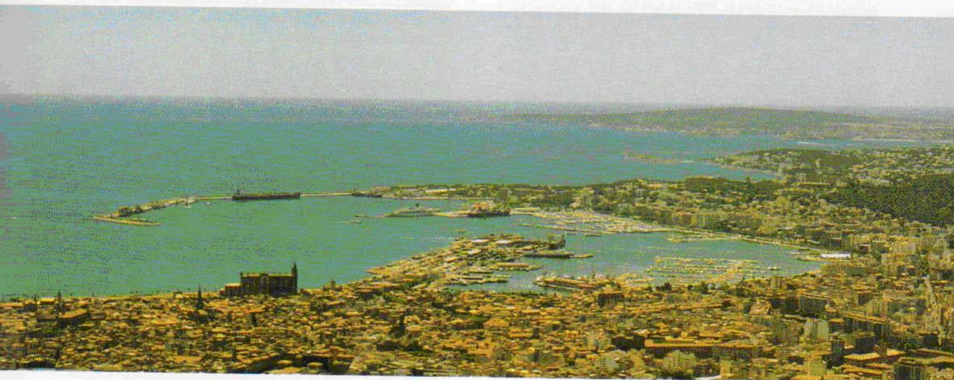
Puerto de Palma seen from the northeast. The pontoons of the Réal Club Náutico can be seen on the right with the northeast breakwater in the centre. The commanding position of Palma Cathedral is particularly emphasised.